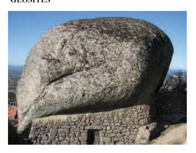
FIGURE 1 – Geology and Culture: traditional architecture in Monsanto Inselberg geosite

Naturtejo Geopark, European and Global Geopark under UNESCO since 2006, has about 170 geosites and a geological history with over 600 million years spread