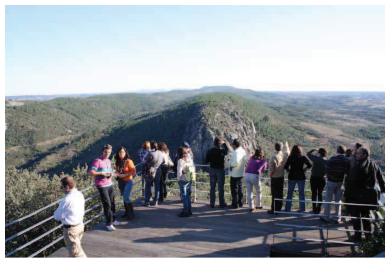
FIGURE 2. Field Trip with teachers in the Portas do Ródão Natural onument

website and a newsletter(Fermeli et al., 2011).