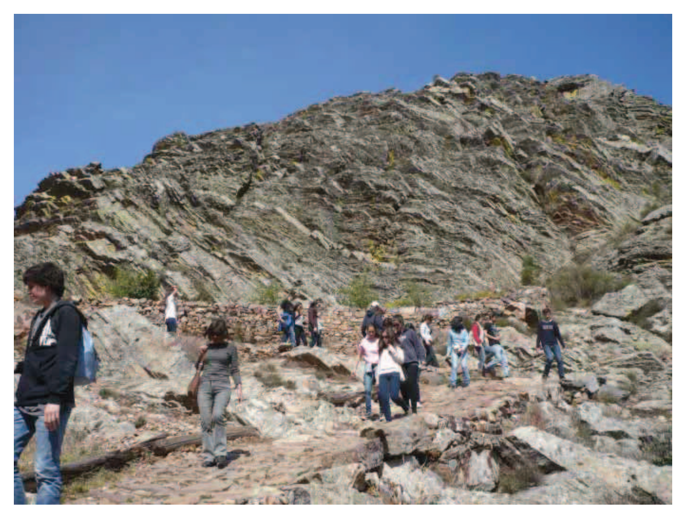
FIGURE\ 3-Naturte jo\ Geopark\ Educational\ Programme\ in\ the\ Penha\ Garcia\ Ichnological\ Park